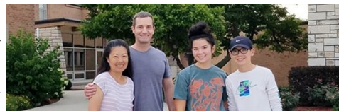
The Palm Family serving at our recent Food Pantry Distribution. Thank you!

DOMESTIC VIOLENCE OUTREACH — ARCHDIOCESE of CHICAGO — AWARENESS - SERVICES - PREVENTION www.domesticviolenceoutreach.org