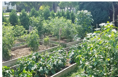
St. Cletus Food Pantry Garden