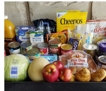
Sample of what client's receive at Food Pantry Distribution. (Dairy/Meat not pictured).