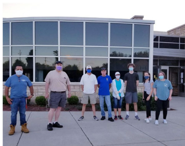
Thank you Volunteers!

Please look for the FOOD PANTRY DONATION bin near the Rectory door, it will be checked daily.