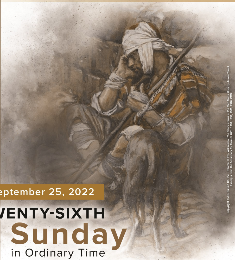
Copyright © U.S. Pauch Co. Inc. The Poor Lazarus at the Rich Man's Door by James Tissot. Excerpts from the Lectioary for Mass © 2011, 1998, 1997, 1996, 1970, CCB.