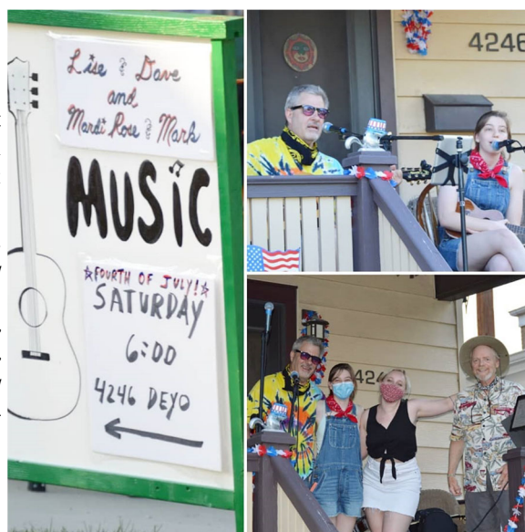
COVID Concert Series

If you've got a creative fundraiser in mind, reach out to us to see how we can partner!