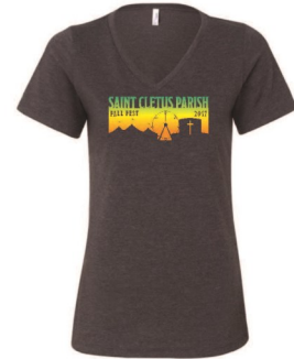
Bella + Canvas Dark Grey Heather Women's V-neck T - $15