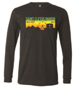
Bella + Canvas Dark Grey Heather Long Sleeve T - $17