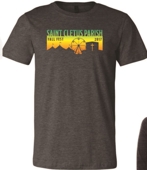
Bella + Canvas Dark Grey Heather Short Sleeve T Blank Back $15