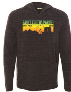
Hooded Pullover Long Sleeve Jersey T T-Shirt - $25