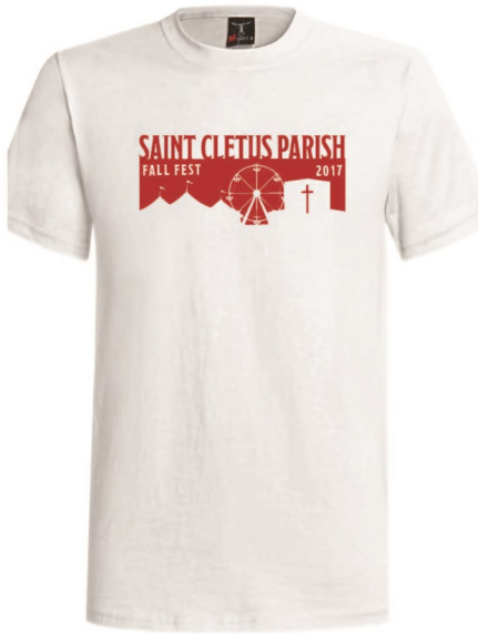
Official Event T-Shirt (with Sponsors on Back) WHITE SHORT SLEEVE ONLY $6!