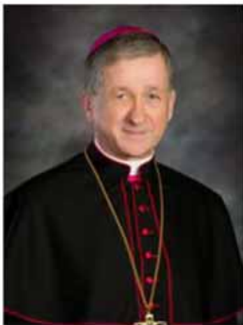
Archbishop Blase Cupich, Principal Celebrant

Join Archbishop Blase Cupich and priests from across the Archdiocese of Chicago for the Holy Sacrifice of the Mass as we petition the Lord to transform our society from a culture of death into a culture of life.