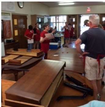
Assignments are given...and we're off...to a great day!