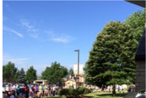
Sale Day dawns...blue skies...shoppers start to gather, turning the corner!