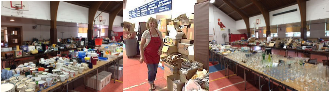
...Chaos gives way to organization ...thanks to many helping hands!