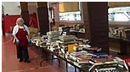
Treasures are sorted...