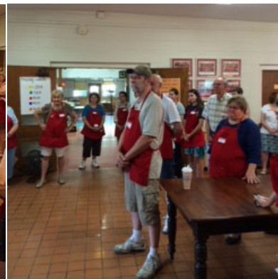
Volunteers join in prayer...