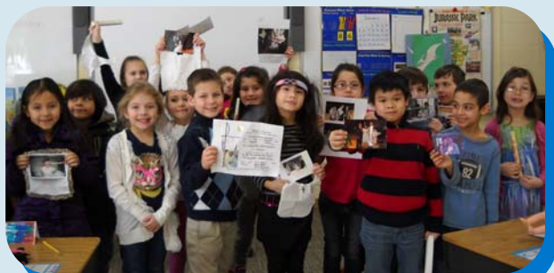
1st Graders studying the Sacrament of Baptism