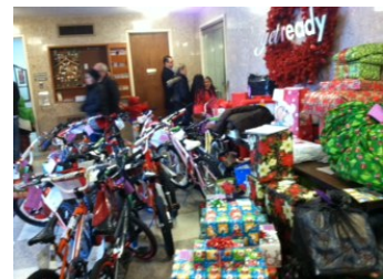
The stacks grow...Filling the Narthex with Christmas Generosity!