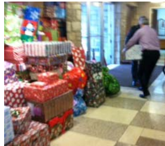
➡ December 7-8, 2013 Accepting gifts