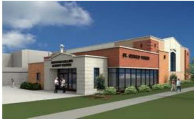
St. Gerald Jonathan Collins Activity Center, Oak Lawn, IL

About eight years ago, however, St. Gerald's Holy Name Society jump started the long-tabled plans. The group launched a carnival to kick off the fundraising effort, a move that motivated other fundraising initiatives, including a penny drive from St. Gerald students that raised more than $5,000.