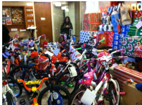
A glimpse of some of the 70 bikes going to happy children & grateful adults.