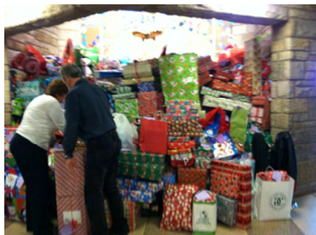
Are all the gifts properly marked?