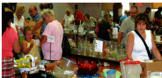
Look at all these great buys!