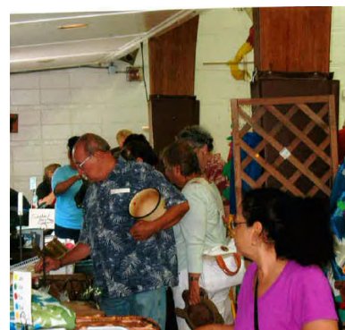
Rummaging for just the right thing.