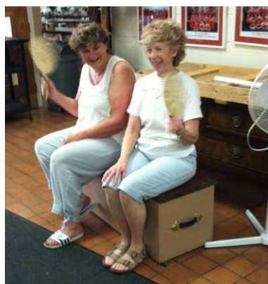
Volunteers trying to keep cool...the old fashioned way! Can't wait for the new Parish Center!