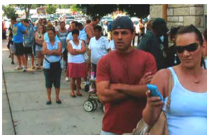
Waiting patiently-just 30 minutes until the door opens...