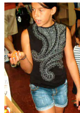
How about buying me this?