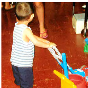
I can help with lawn work!