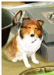
Pick me! I'm a real treasure.