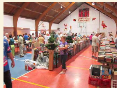
The rummaging continues...