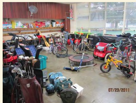
Sporting Goods Room