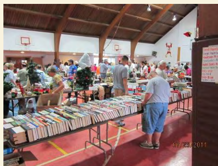
Rummaging in progress!