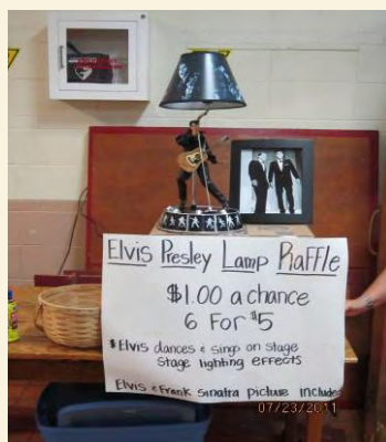
Extremely popular Elvis raffle!