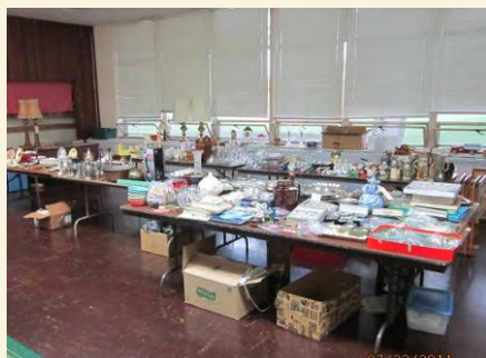
Assembling treasures: Treasure Room