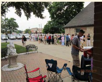
Front of line: early customers gather