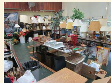
Home Décor Room