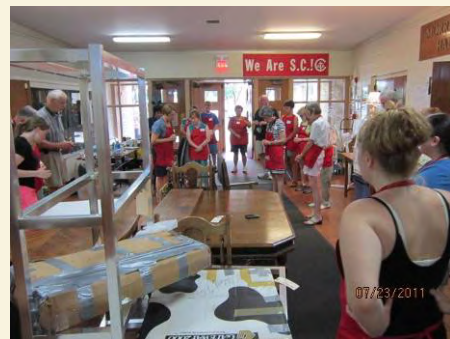
All work done in God's name...