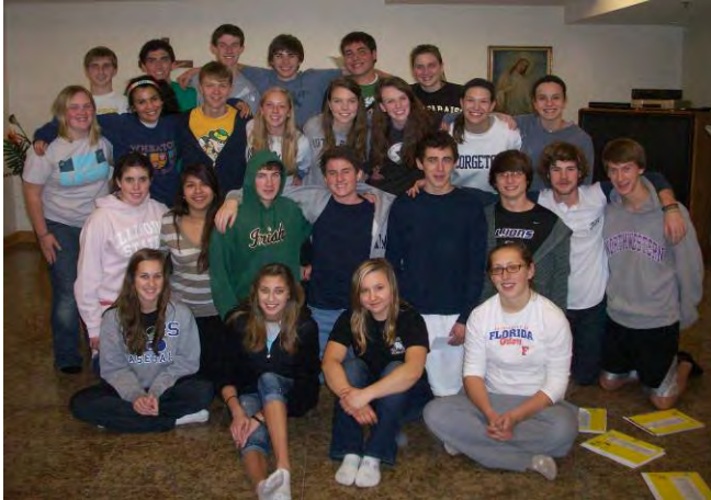
26 Juniors and Seniors in high school attended the Kairos 6 Retreat that was sponsored by the St. Cletus Youth Ministry. We had a wonderful weekend!