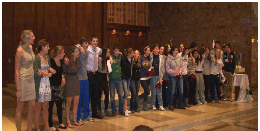
We ended our retreat with our parents at our closing ceremony on Sunday, November 14.