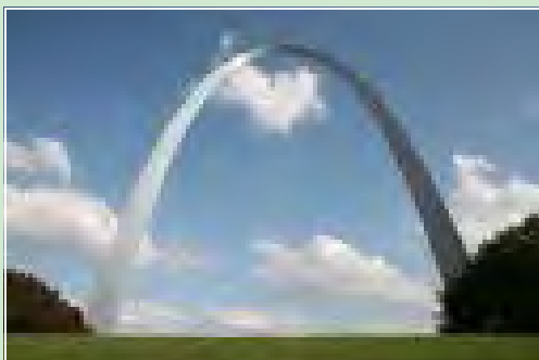
St. Louis Gateway Arch aka Gateway to the West