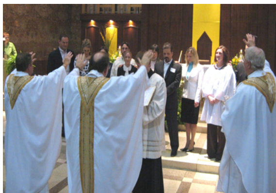
Laying on of Hands