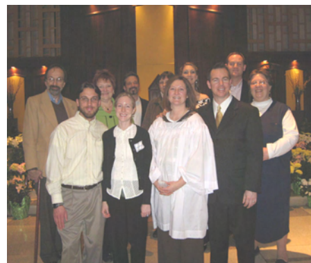
Candidates & Catechists