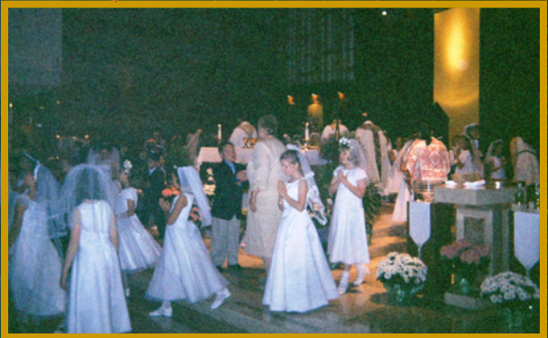
Our Very Proud Pastor