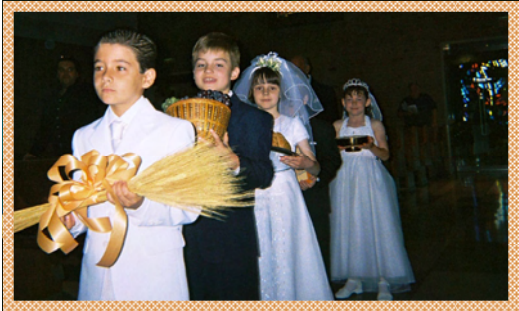
Bearing Gifts to the Altar