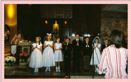
Our young talents grace us with special song.

Our Communicants in prayer at the altar of the Lord.