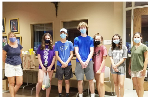
August 13 Food Pantry Volunteers.