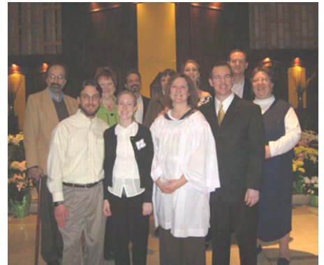
Candidates & Catechists